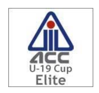
Group A: Hong Kong, Qatar, Malaysia, Singapore & Bahrain Group B: Afghanistan Nepal, UAE, Oman & Thailand

Thailand hosted the ACC Under-19 Elite Cup held in Bangkok & Chiang Mai from 1st to 10th February, 2011. The ACC Under-19 Elite Cup has 10 teams from across Asia take part. The teams were divided into two groups. Thailand managed to win 1 of their group matches against Oman. Thailand finished the tournament placed 8th and retained their Elite ranking. Afghanistan beat Nepal by 61 runs in the finals to claim the championship.